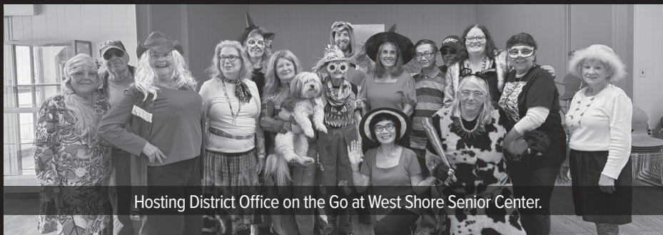
Hosting District Office on the Go at West Shore Senior Center.