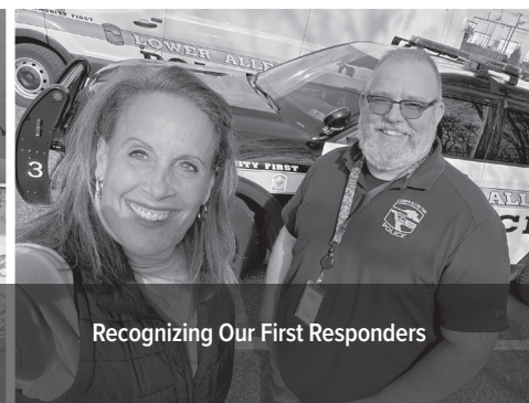
Recognizing Our First Responders