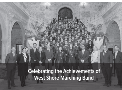
Celebrating the Achievements of West Shore Marching Band

One of the best parts of my job is getting to recognize those individuals whose hard work and selfless service makes our community such a wonderful place to call home. Check out some of the awesome people and things happening around the 88 th District!