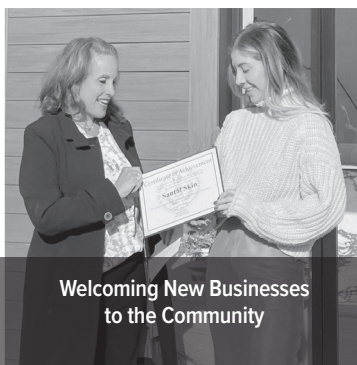
Welcoming New Businesses to the Community