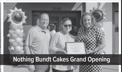
Nothing Bundt Cakes Grand Opening

I was also glad to have a legislative booth at Shiremanstown Community Day, the Lower Allen Township Pocket Party, Jubilee Day, two Mechanicsburg Saturdays on the Square and the New Cumberland Iron Bridge Festival.