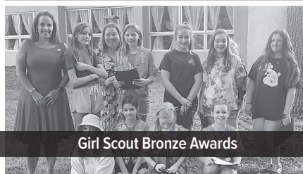
Girl Scout Bronze Awards