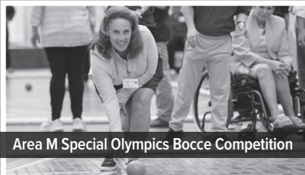
Area M Special Olympics Bocce Competition